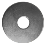
(20) 1 1/4" washers