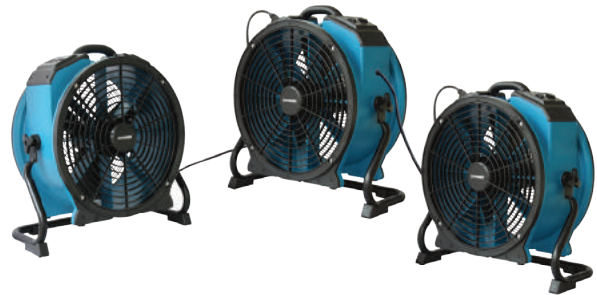
Built-In Power Outlets for Daisy Chain