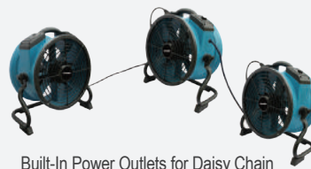
Built-In Power Outlets for Daisy Chain