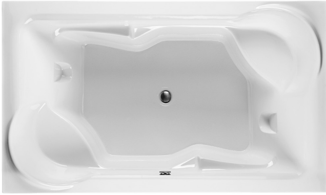
Features integral seats.