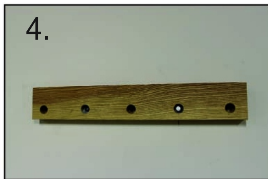
4. Fix all the screws firmly in the 5 slots provided