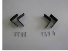
METAL CORNER BRACKETS: 4 PCS SMALL METAL SCREWS: 8 PCS (2 PCS- right corner brackets, 2 PCS - left corner brackets)