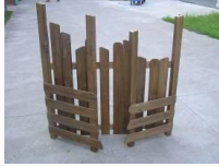
FOLDED WOODEN CRECHE BACKDROP: 1 PC