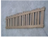
FOLDED WOODEN CRECHE ROOF: 1PC

You will need a Philips screwdriver to assemble this item.