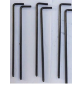
METAL GROUND STAKES: 6 PCS