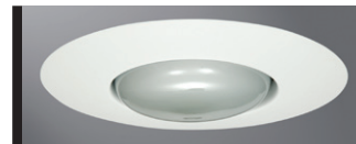
300P White Trim

P = White trim SN = Satin nickel trim TBZ = Tuscan bronze trim