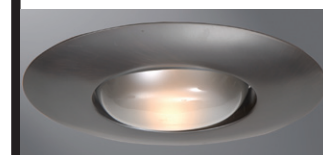
300TBZ Tuscan Bronze Trim