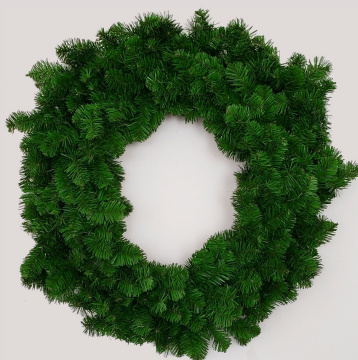
Out of the box