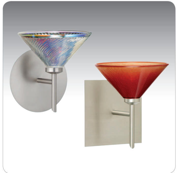
MINI SCONE SHOWN IN DICRO SWIRL & SUNSET WITH SQUARE CANOPY

UL or ETL Listed. Suitable for Damp Locations (interior use only).