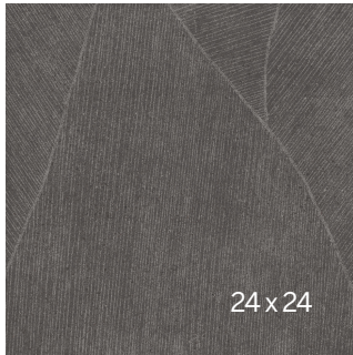
24 x 24