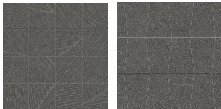
3 x 3 Stacked Mosaic Mounted on a 297 x 297 sheet