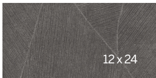
12 x 24