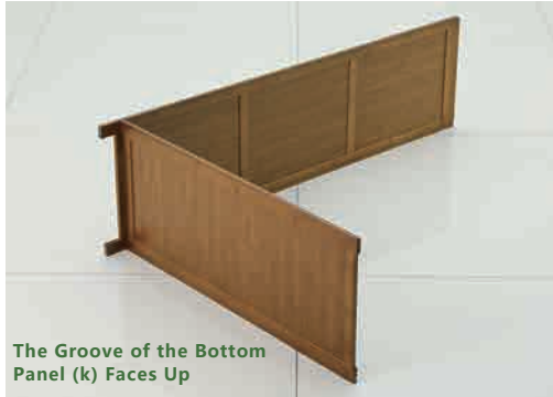
The Groove of the Bottom Panel (k) Faces Up

The assembly instructions may vary depending on the number of tiers.