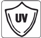
95% Blockage Rate