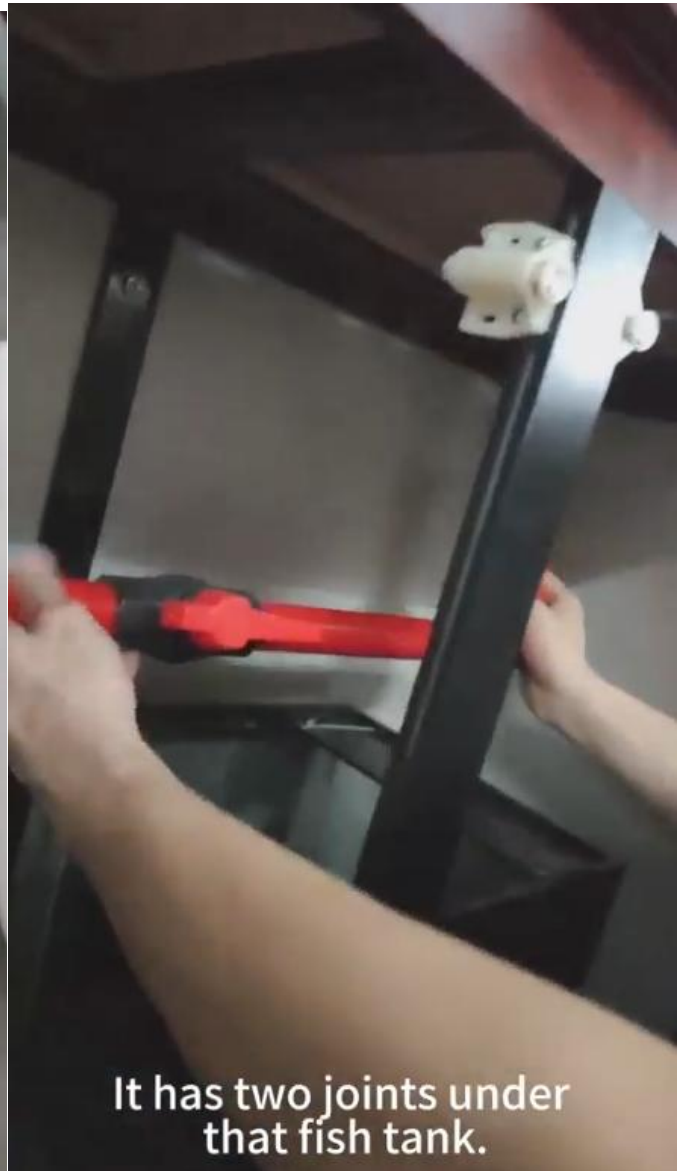
It has two joints under that fish tank.

Our first step is to install the sewer pipe