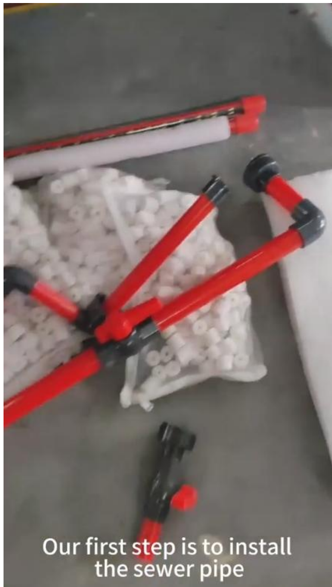
Our first step is to install the sewer pipe