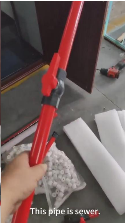
This pipe is sewer.

This is from Sheung Shui. This pipe is sewer.