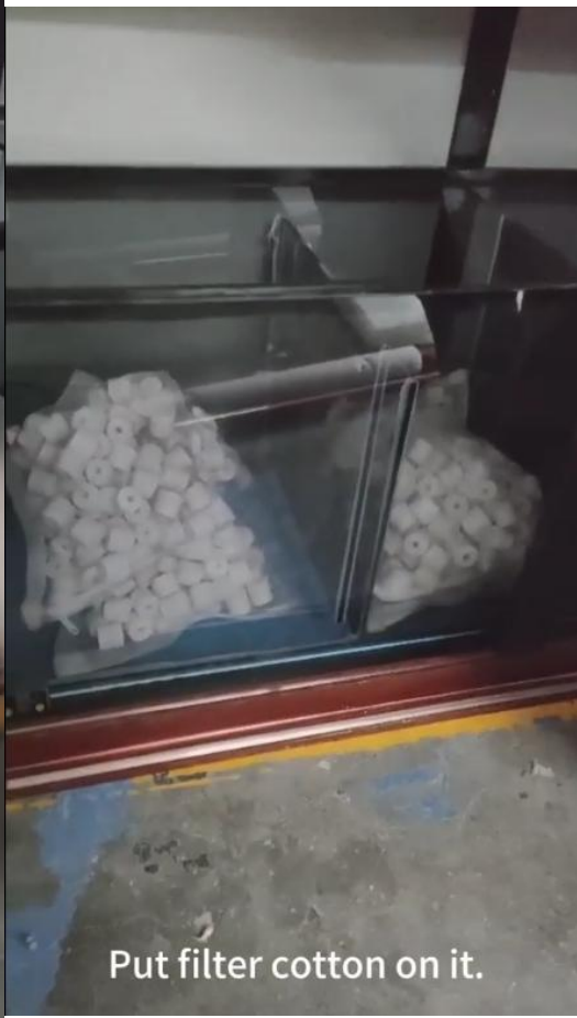
Put filter cotton on it.

Put two packs in one grid. Put filter cotton on it.