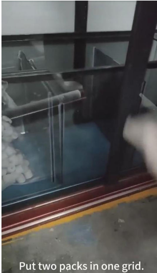
Put two packs in one grid.