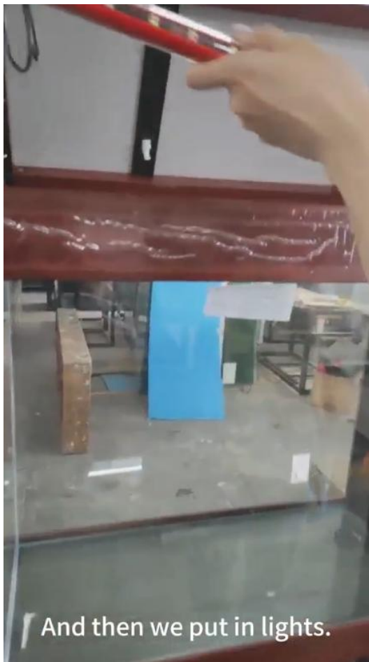
And then we put in lights.