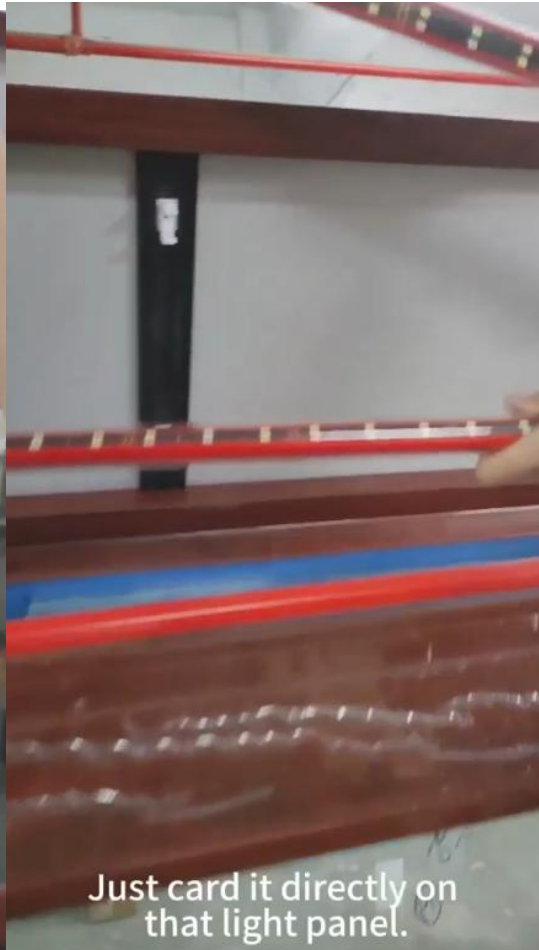
Just card it directly on that light panel.

And then we put in lights. Just card it directly on that light panel.