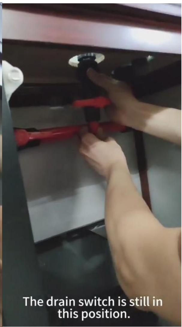
The drain switch is still in this position.