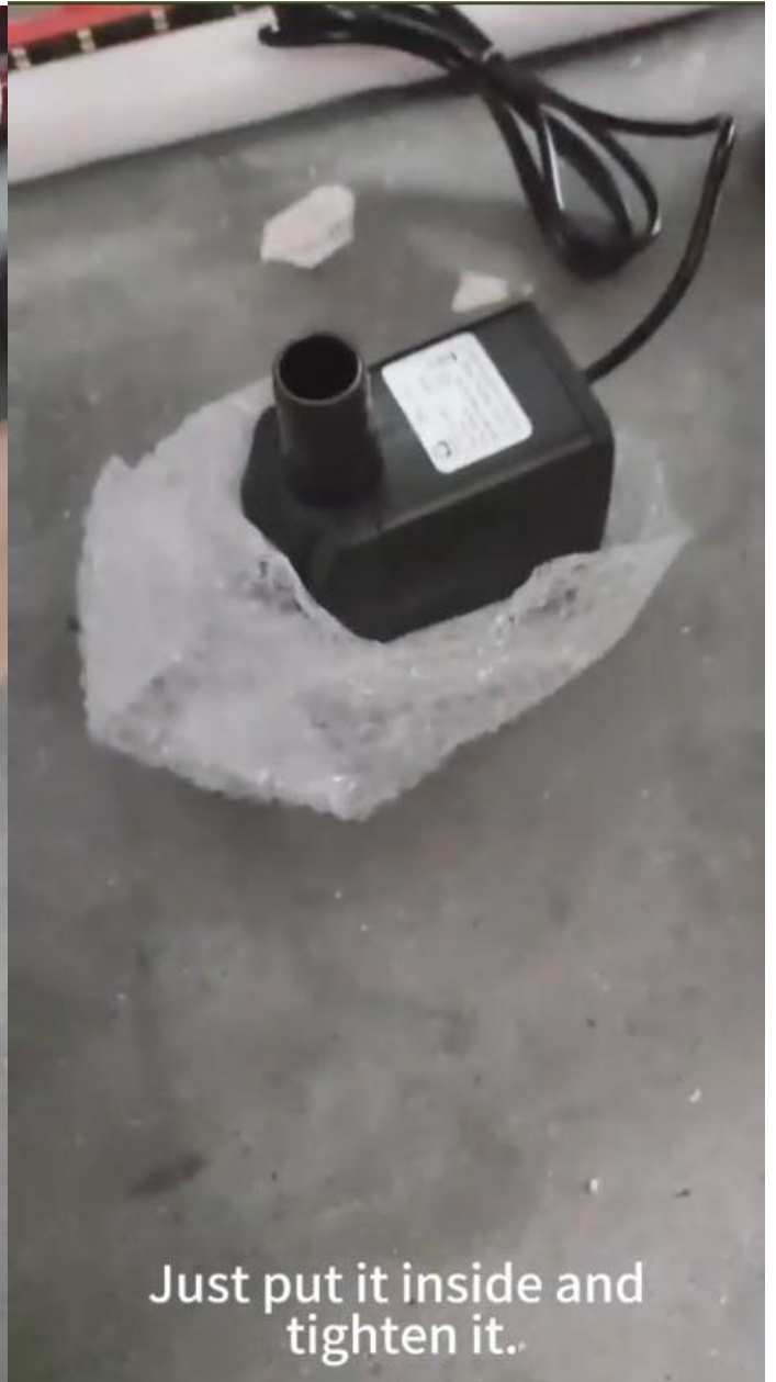
Just put it inside and tighten it.

Our connector can be placed separately at that time.