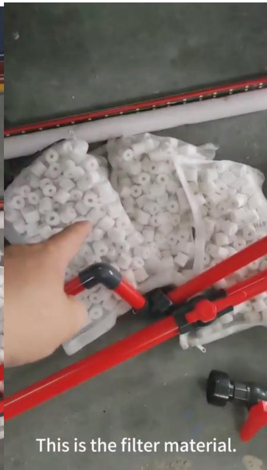
This is the filter material.

Here are two lamps. This is the filter material