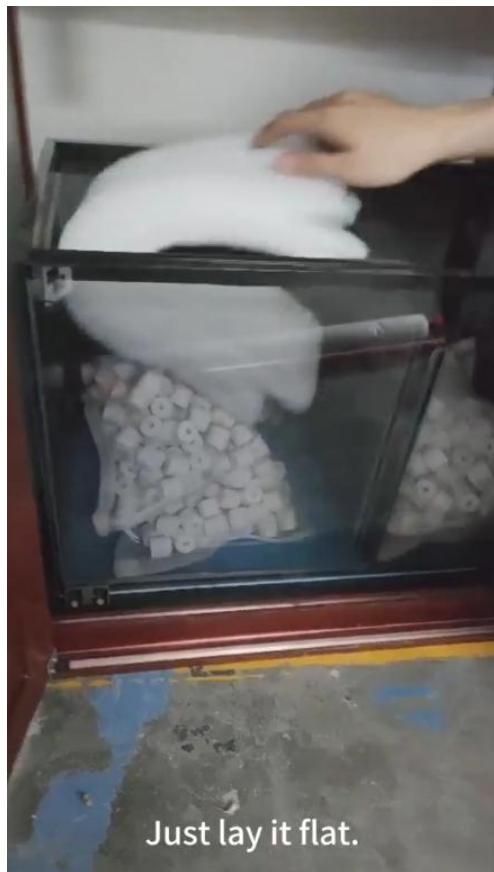
Just lay it flat.

Put two packs in one grid. Put filter cotton on it.