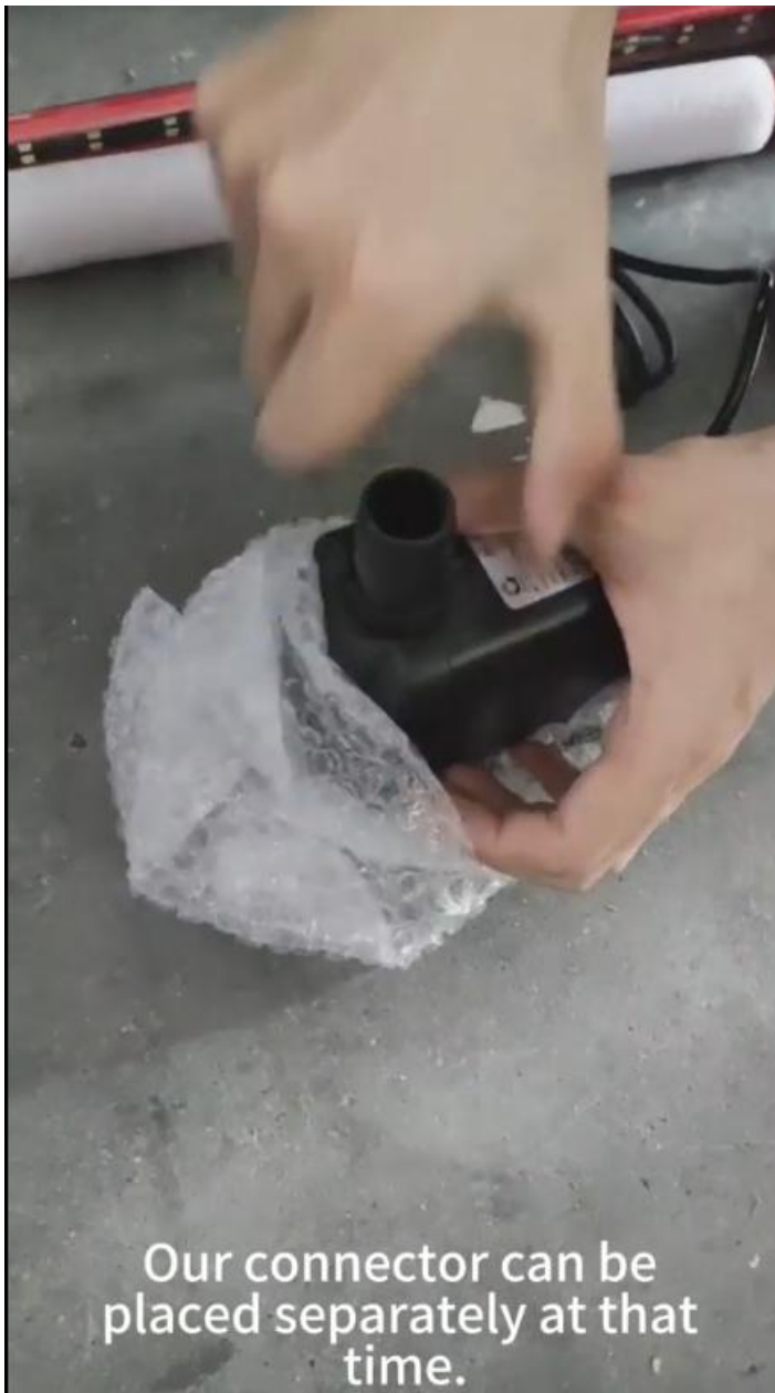
Our connector can be placed separately at that time.