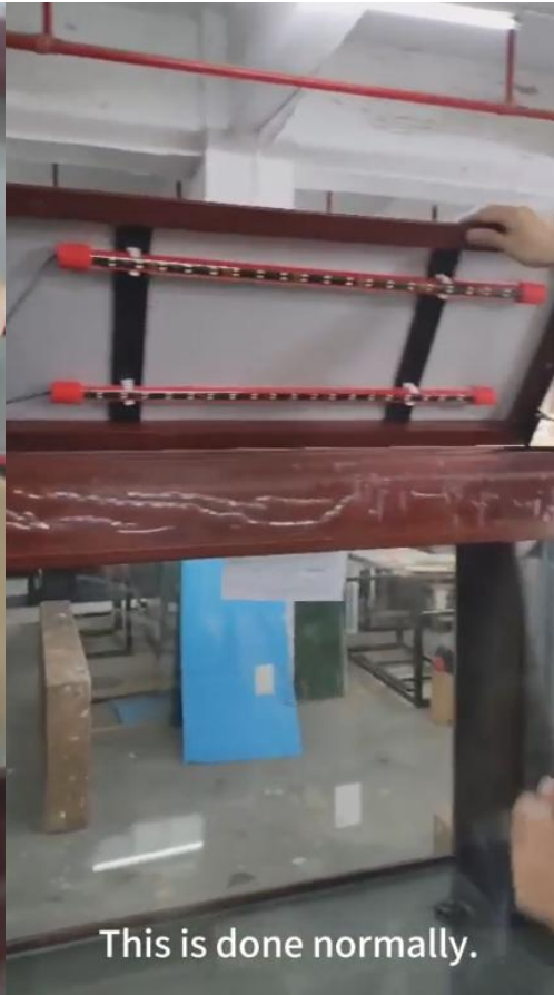
This is done normally.