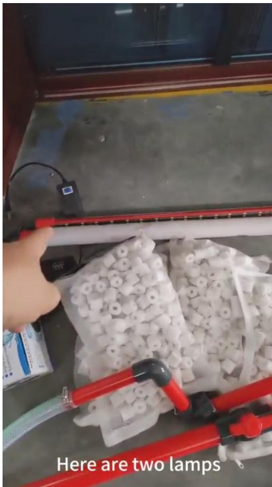
Here are two lamps