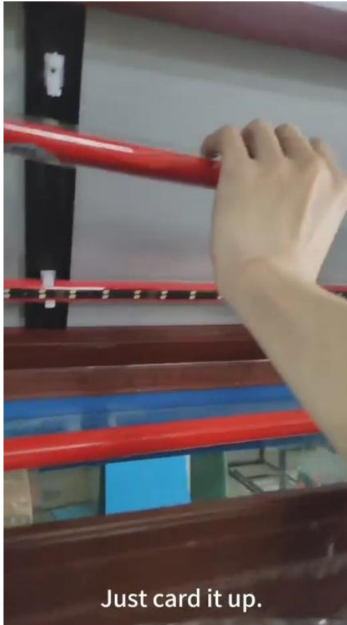
Just card it up.

And then we put in lights. Just card it directly on that light panel.