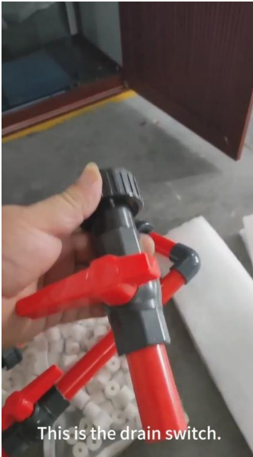
This is the drain switch.