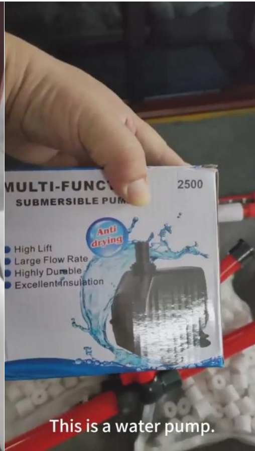
This is a water pump.

This is the drain switch. This is a water pump.