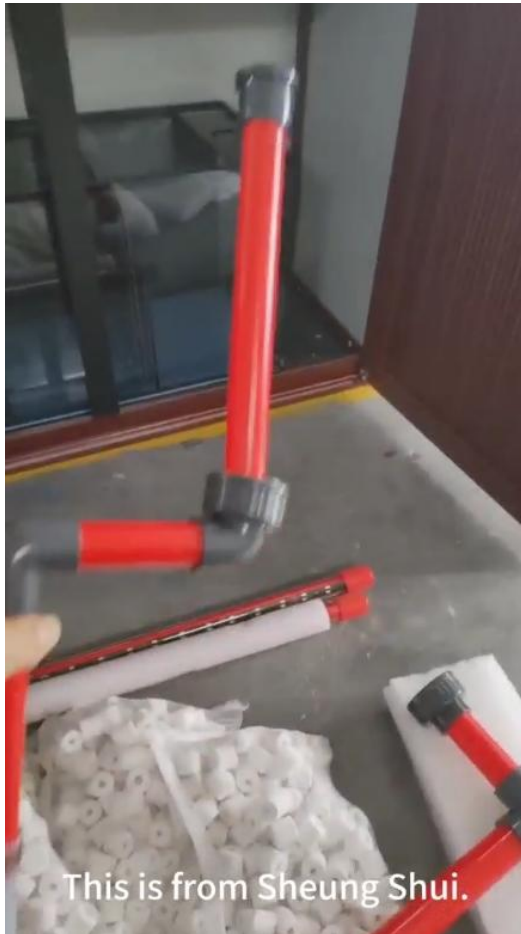
This is from Sheung Shui.

Here are two lamps. This is the filter material