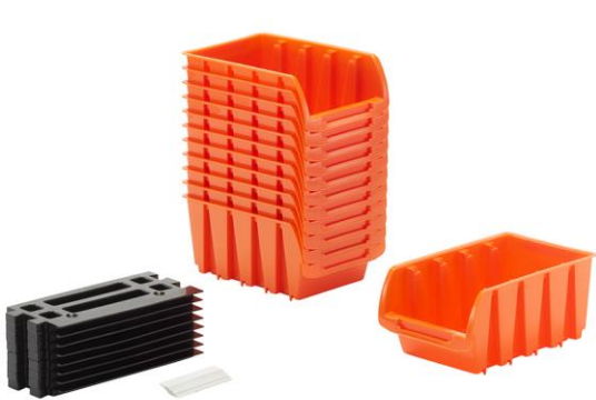
SMALL BIN PACK