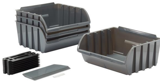
LARGE BIN PACK