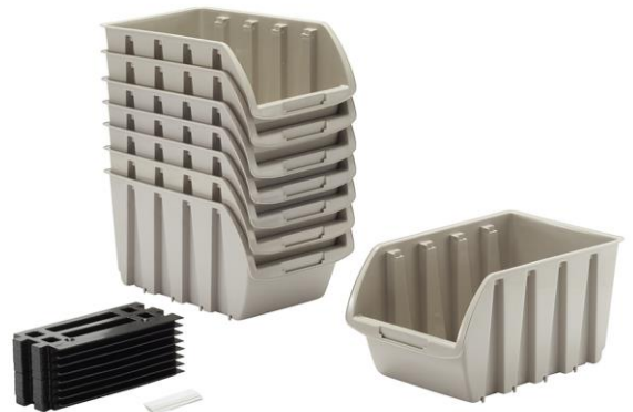
MEDIUM BIN PACK