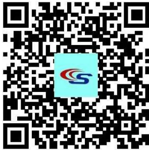
Chinese Android APP QR code

Following are QR codes of different operating systems.