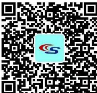
Overseas Android APP