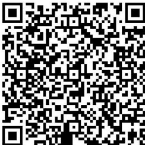
Apple APP QR code