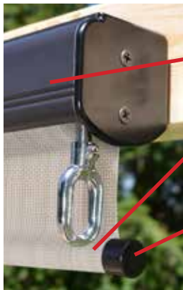
A. Valance x1