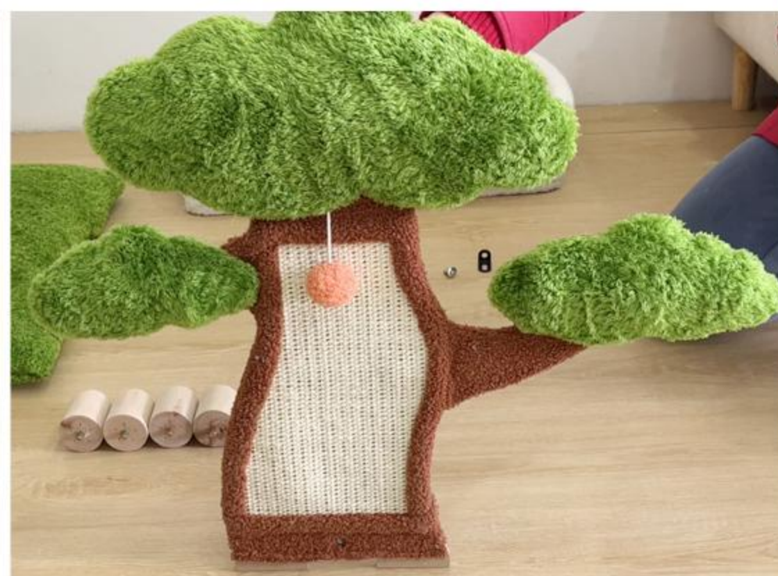
8 Great! The pine trees have been assembled