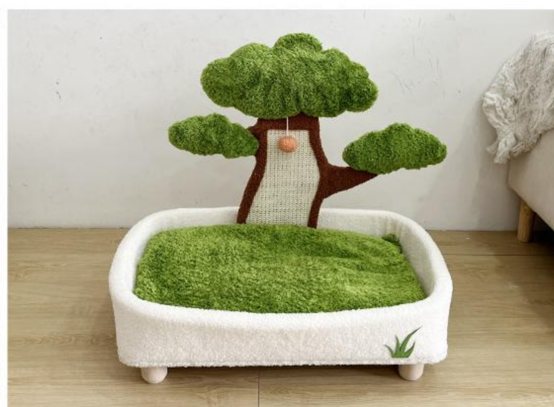
11 Great! Just install four bed legs and it's done. Your home has gained another fashionable decoration