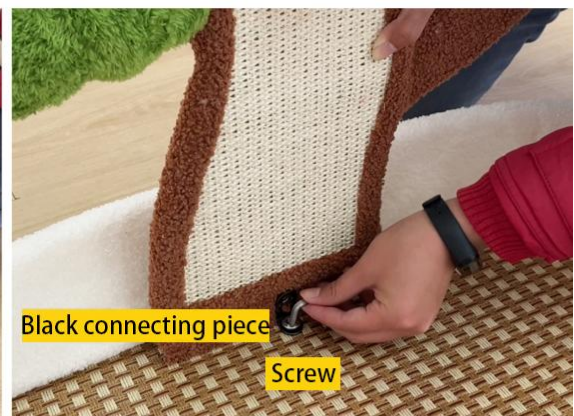
9 Fix the tree trunk to the square bed with black link pieces and screws