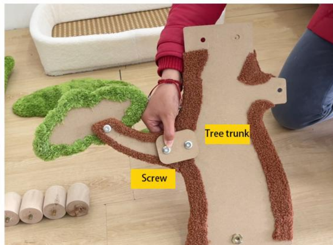
5 Fix the branches to the trunk with screws