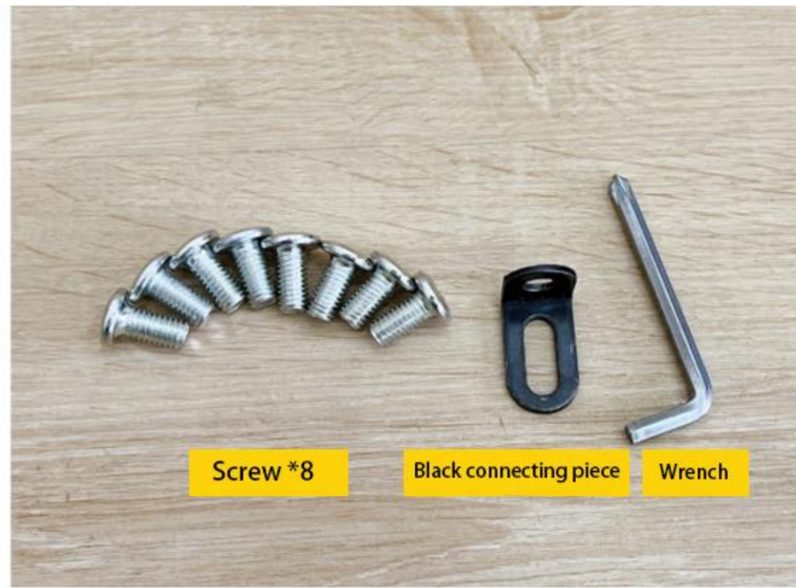
2 Hardware accessories: Screws *8, wrench *1, black connecting plate *1