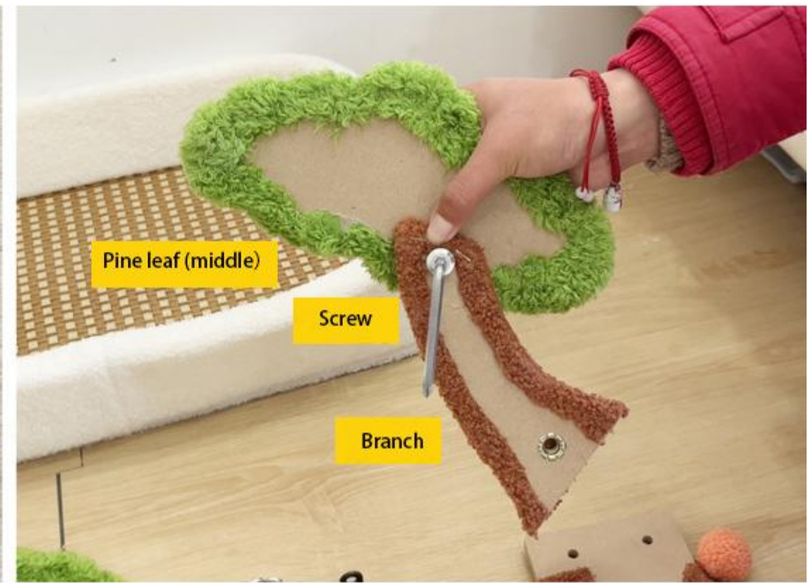
3 Fix the pine leaf (middle) to the smaller end of the branch with screws