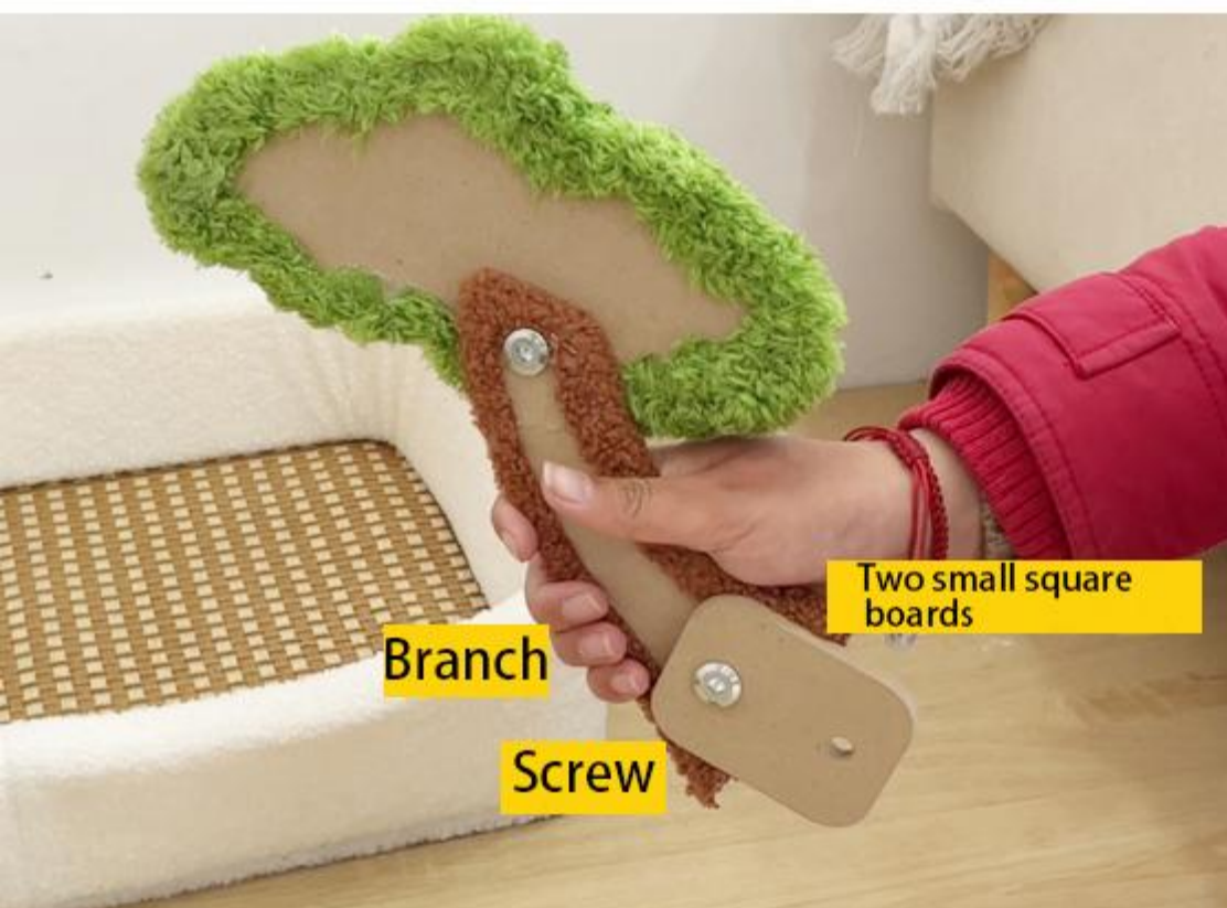
4 Fix one end of the two-hole small square board to the larger end of the branch with screws