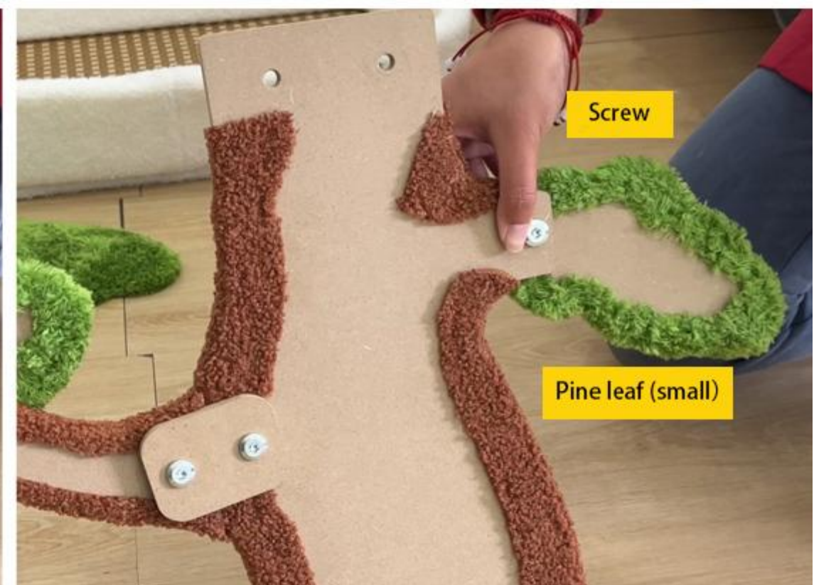
6 Fix the pine leaves (small) to the other end of the tree trunk with screws