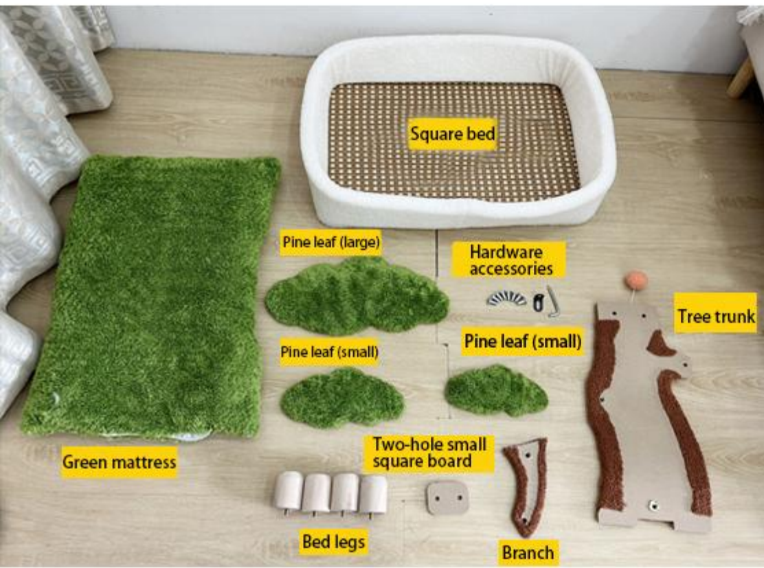
1 Check the accessories and place them properly to avoid loss during installation