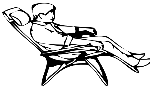
Tighten the adjustment tighteners to hold your position and enjoy.