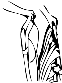
Place your hand on the chair backrest by the pillow and your other hand on the seat base near the adjustment tightener