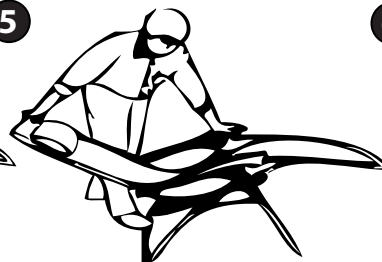
Then begin to adjust the position of the backrest upwards