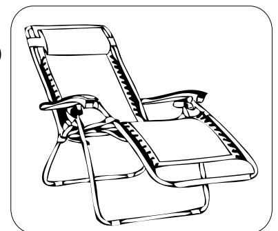
Congratulations! Setup of your new Zero Gravity Chair is Complete!