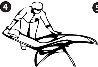
Lay the backrest all the way back