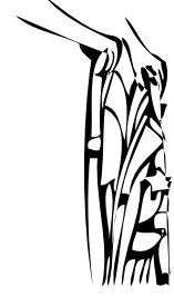
Gently pull the chair backrest away from the seat base to open the chair