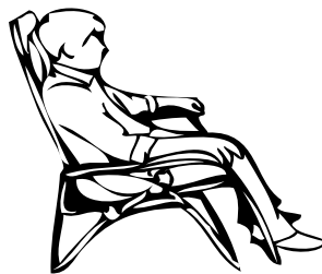
Sit in the chair