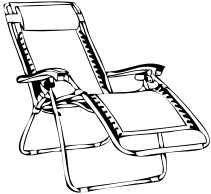
1 - Chair