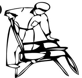
Position backrest for sitting