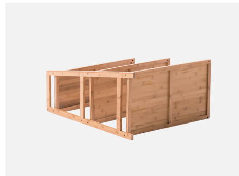
③ Secure Panel (b) (c) as picture.