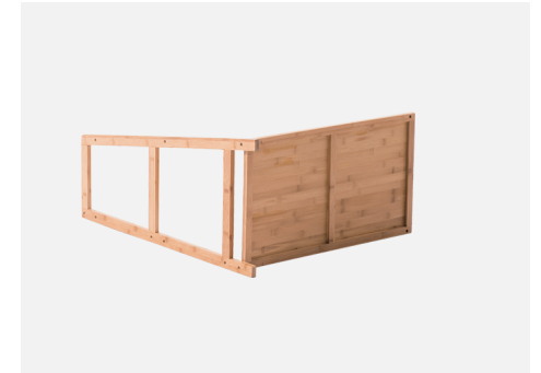
② Secure Left Frame (a-A) and Tier 1 Panel (d) as picture shown.

© 2020 - 2021 by Pundarika LLC - MoNiBloom.com