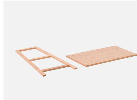
① Position Left Frame (a-A) and Tier 1 Panel (d).