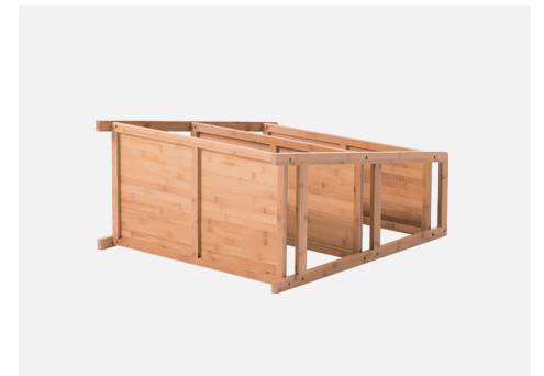
④ Secure Right Frame (a-B).