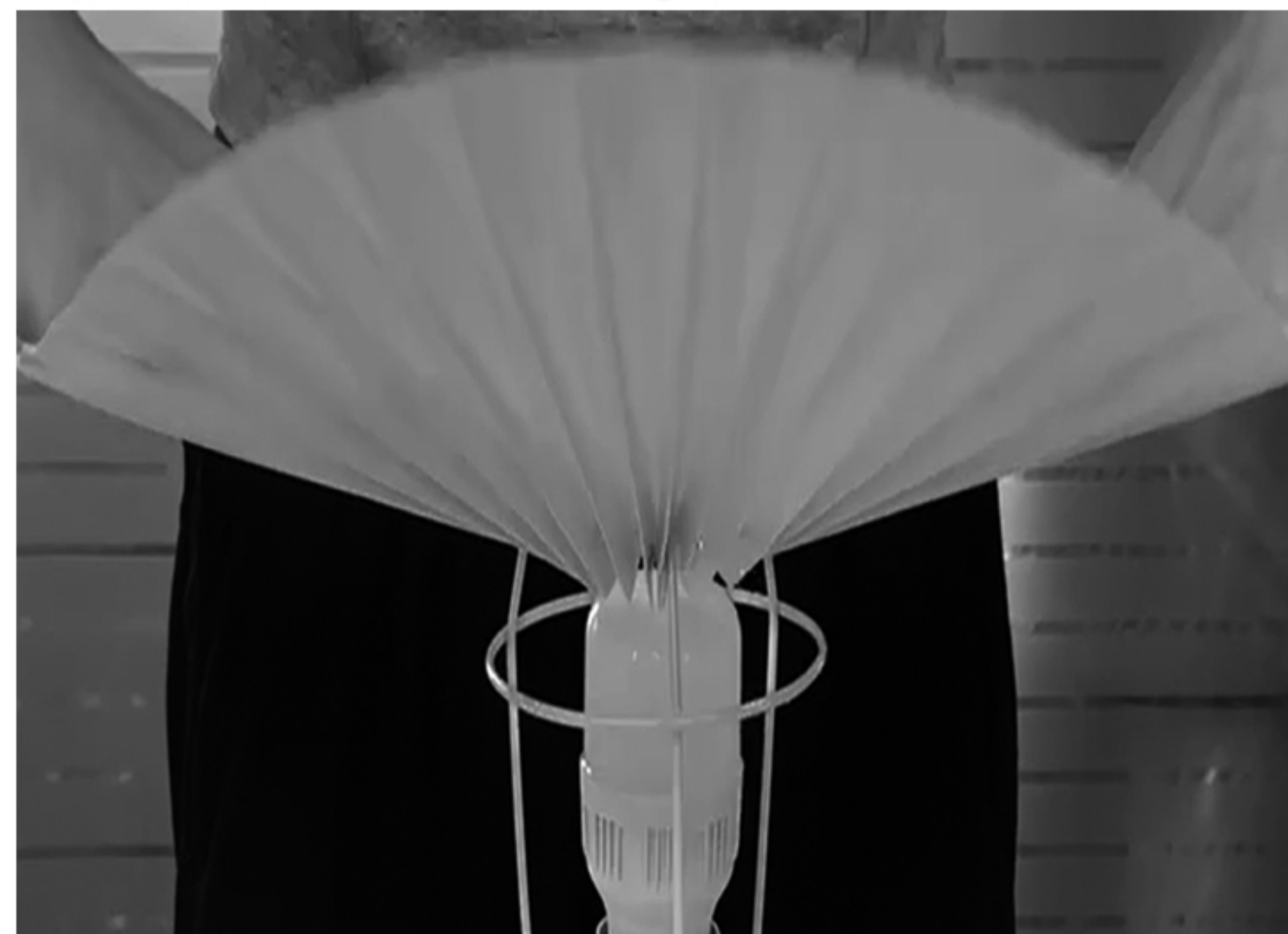
Lampshade installation diagram: