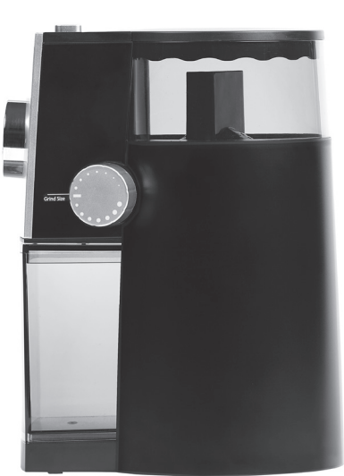
Proper placement of removeable parts