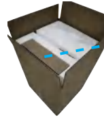
Fountain packaging box x 1