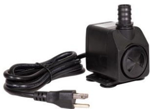
Fountain Pump 1x