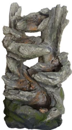
Fountain (4 LED lights pre-installed) 1x