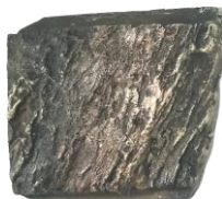
Fountain Back Door 1x