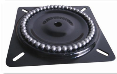
full steel ball bearings