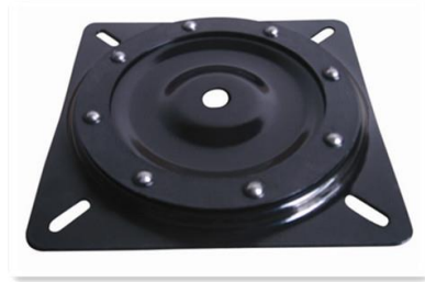
half steel ball bearings