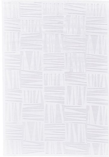
WHITE / WHITE