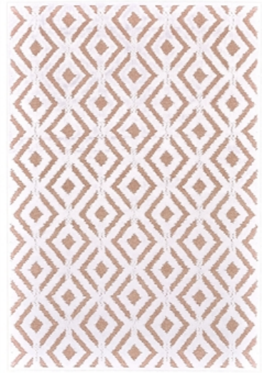
BLUSH / WHITE