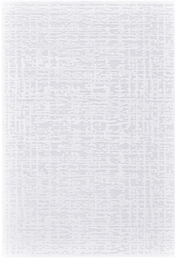
WHITE / WHITE