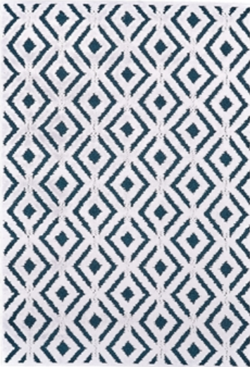
TEAL / WHITE