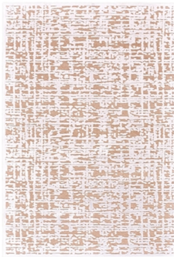
BLUSH / WHITE