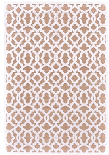
BLUSH / WHITE