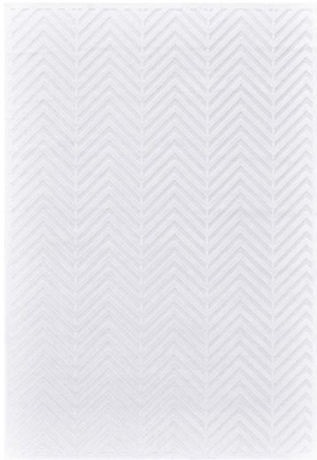
WHITE / WHITE