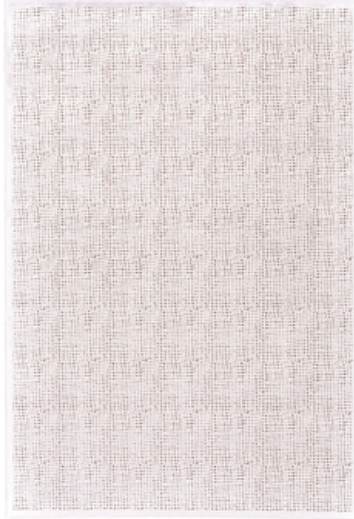
BLUSH / WHITE