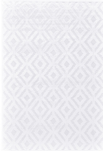
WHITE / WHITE