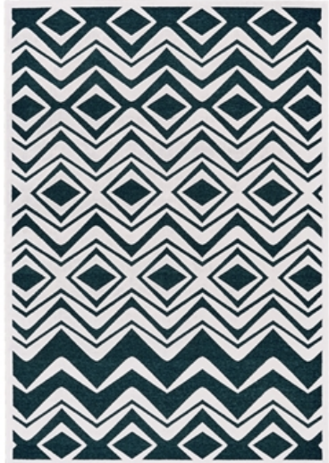
TEAL / WHITE