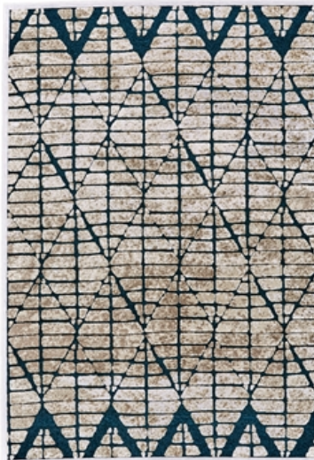
TEAL / WHITE