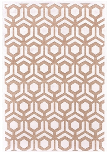
BLUSH / WHITE