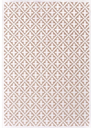
BLUSH / WHITE