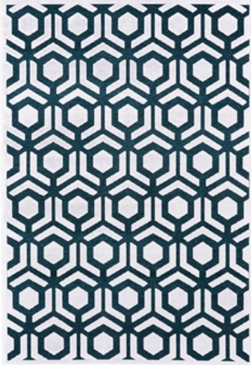
TEAL / WHITE