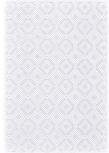
WHITE / WHITE