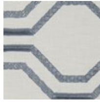
2-24" x 16" Pillows 8334- 09CC