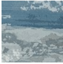
Pillow Fabric: 2- 21" x 21" Pillows 8335-09CC