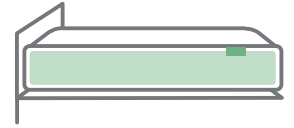
Platform or slatted base