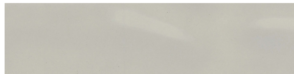
Sage 3"x12" (Glossy Only)

3"x12" Size Available in Matte & Gloss Finish. Picket Available in Gloss Finish Only.