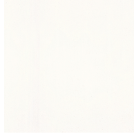
Matte White Lacquer - MWL