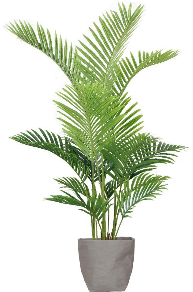
Finished Palm Tree with Paper Eco Planter