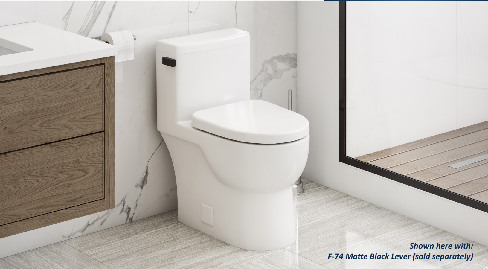
Shown here with: F-74 Matte Black Lever (sold separately)