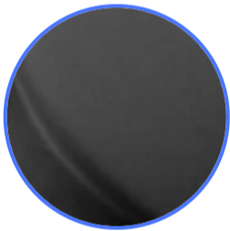
Satin Black - 190