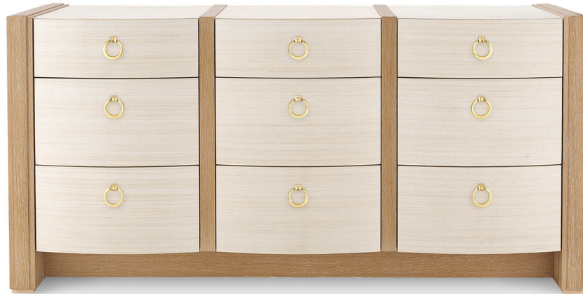
ALBERT EXTRA LARGE 9-DRAWER, LIGHT NATURAL & NATURAL