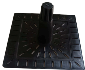
B. Self-Watering Tray