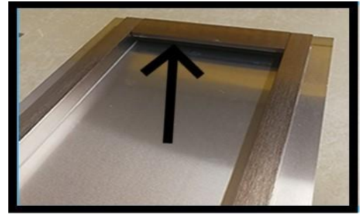
Lip for hanging over screw.

For the single panel art, measure the distance between the first and second screw and repeat per number of desired screws.