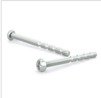
Break-Away Zinc Plated Machine screw, Pan Head, Combined Pozi Slot Drive, M4, Type B Point

Product № 2800 Packaging format: Bag of 100 units