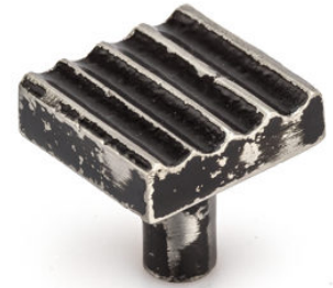
Contemporary Forged Iron Knob - 8070