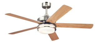
Reversible Beech Finish Blades