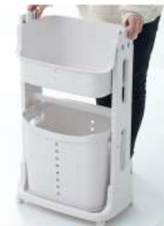
Step 6: install the small storage basket