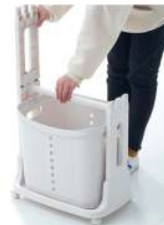
Step 5: install support frame on the bar