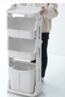
Step 9: install the top basket