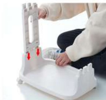
Step 2: install the support frame on the base