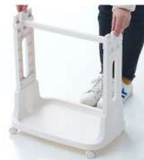
Step 3: install the horizontal bar