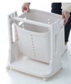
Step 4: install the large storage basket