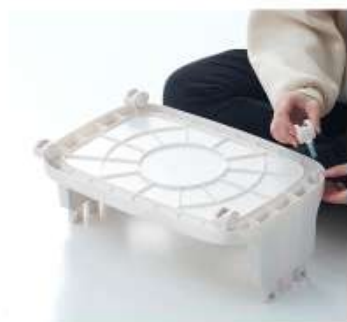
Step 1: install the wheels into the base