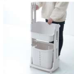
Step 7: install the support frames