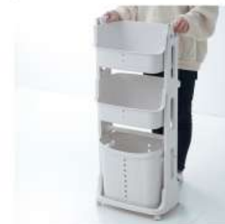
Step 8: install the second small basket