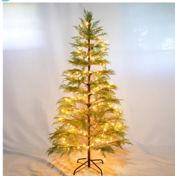
Now plug in and turn on the lights.