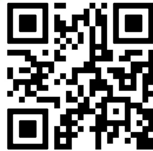
Scan this QR Code to watch our assembly instructions