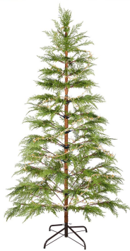
Wrap the star string lights on the tree as shown