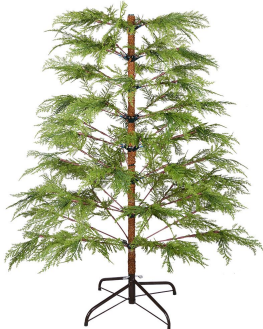
Insert section B into section C.