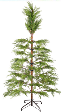
Insert section A into section B.