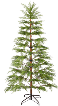
Arrange the leaves and branches to your desired shape