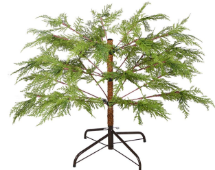
Insert section C into the stand