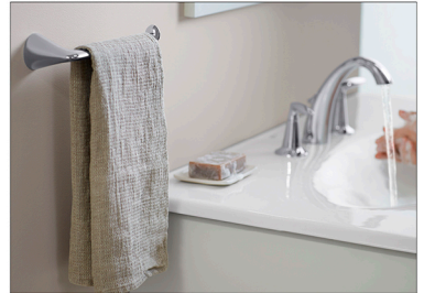
KOHLER® accessories make it easy for even the most casual DIY-er to update the beauty and function of their bathroom space.