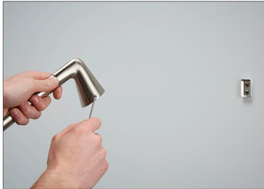
Step 4: Loosen the set screw in the accessory.