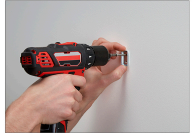
Step 3: Position and mount template to wall, using screws, drywall anchors or ceramic anchors, depending on wall composition.