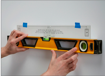
Step 1: Use level and position template on wall.