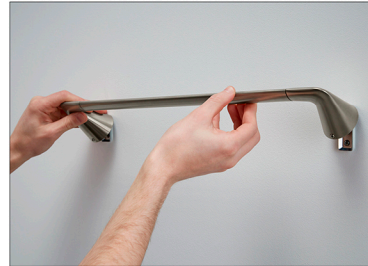
Step 5: Mount the accessory onto the secured wallplates. Tighten set screws to secure accessory to wall plate.