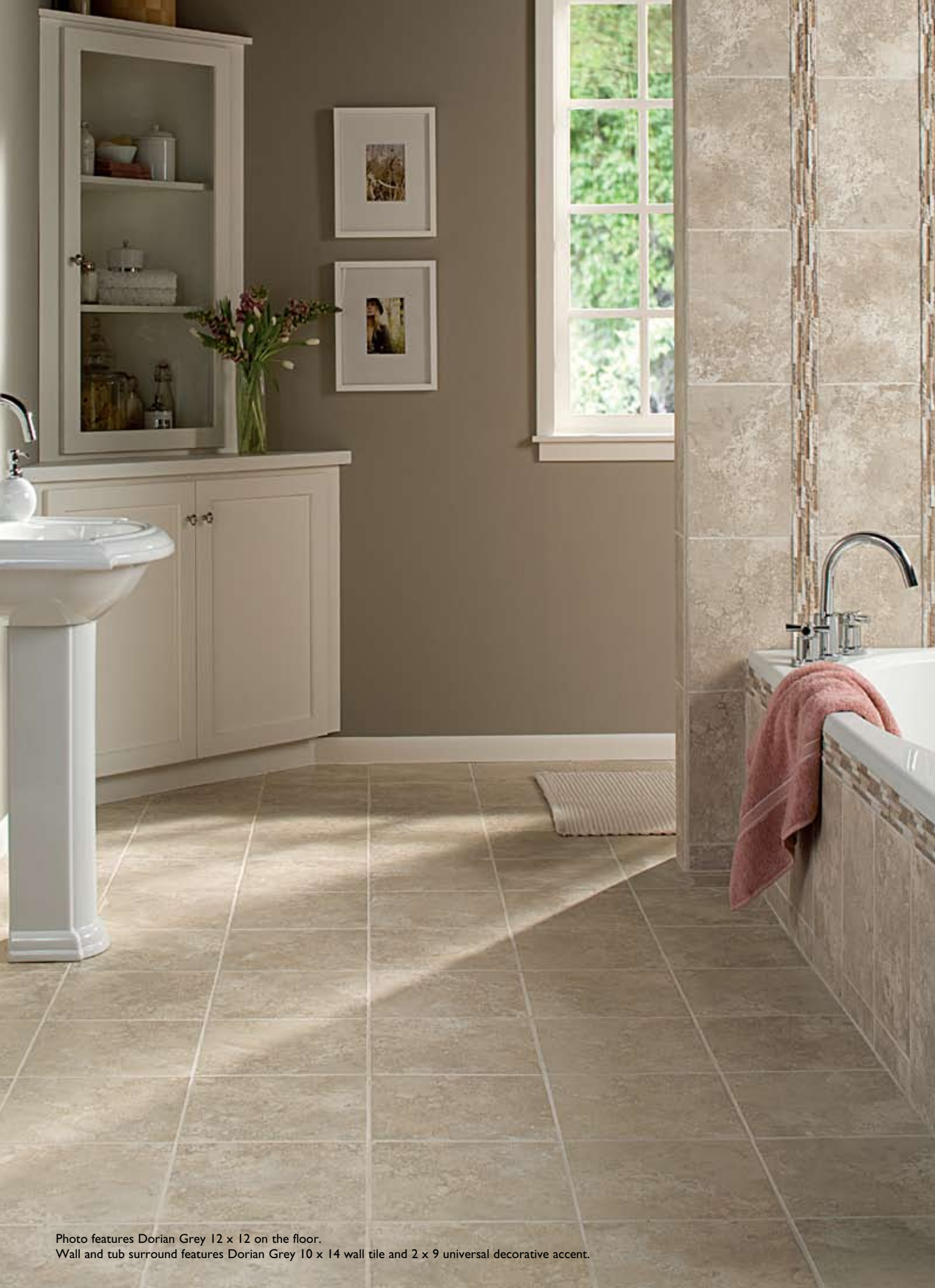
Photo features Dorian Grey 12 x 12 on the floor.

Wall and tub surround features Dorian Grey 10 x 14 wall tile and 2 x 9 universal decorative accent.