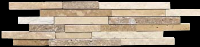
UNIVERSAL DECORATIVE ACCENT