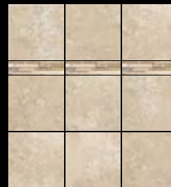
GRID PATTERN WITH ACCENT