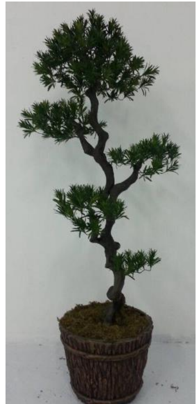
Finished Yacca Tree