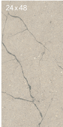
24 x 48