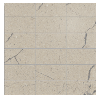
2 x 4 Stacked Mosaic Mounted on a 297 x 297 sheet