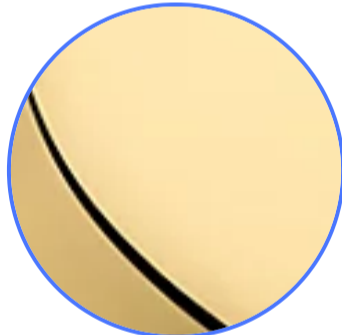
Non-lacquered Brass - 031