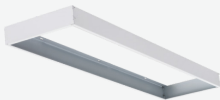
Surface Mount Kits