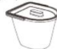
Squatting Toilet with Hollow Inner Bucket

Warm Tips: Inner drum type and PU seat cushion according to the purchase of the package configuration.