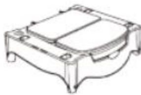
Main body 1 unit