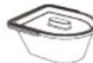
Solid Bottom Inner Drum for Indoor Use