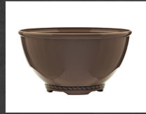
11.5" HDR® Westbourne Bowl, Saddle