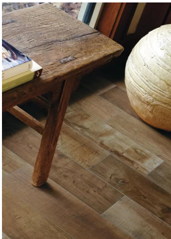
Whiskey 6 x 36