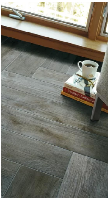
Steel 6 x 36