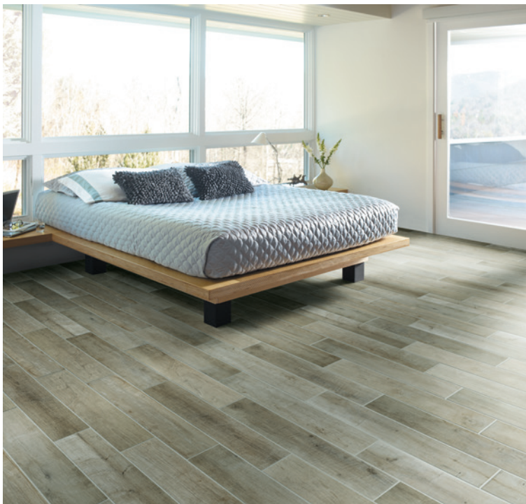
Pewter 6 x 36

Head out to the County Line, where every day becomes a bit more casual. With the look of knots and raised woodgrain, this easy to clean and maintain porcelain tile makes life a little smoother.