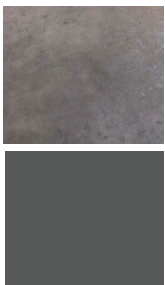
Dark Concrete/ Charcoal

Omega complete tables combine our ever-popular and easy-to-assemble resin alpha base with a new tabletop that has been specially designed with a coordinating resin edge. The tabletops provide extraordinary resistance to scratching, abrasion and impacts.