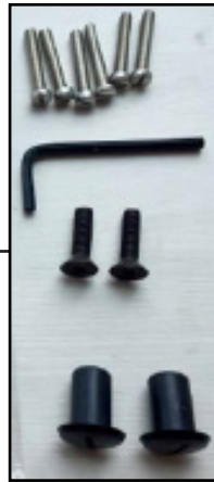
Hardware Kit USSP0093