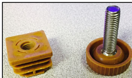
Footpad Set USSP0319