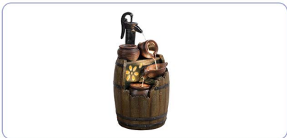
01 Water Fountain