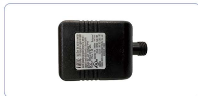
04 Transformer for Pump