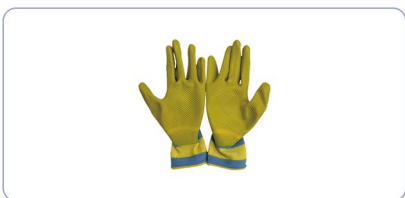
05 Gardening Glove