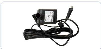
03 Fountain Water Pump