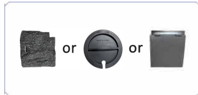
02 Fountain Back Panel