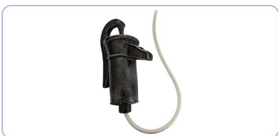
07 KD Part

*The water pump and transformer are housed in the same small box.