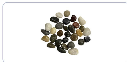
06 1 Pound Pebbles