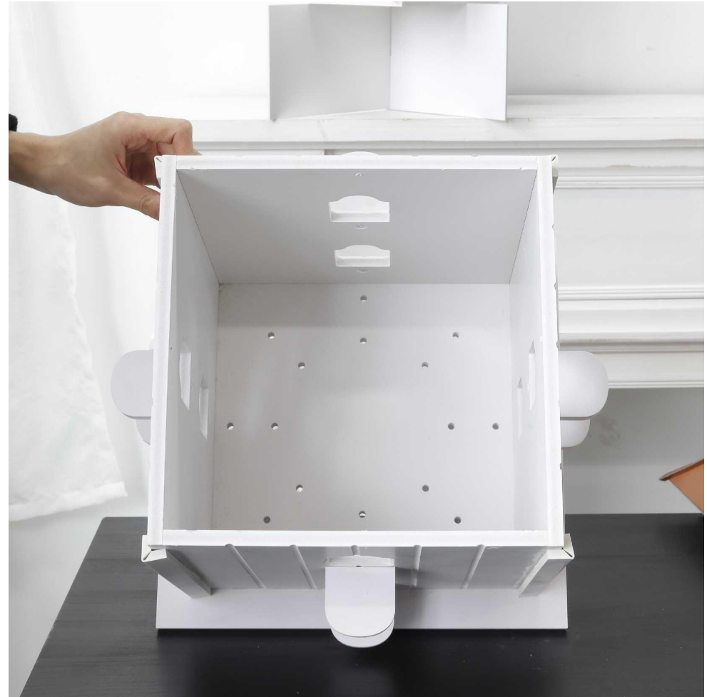
Step2 Take out the inner partition