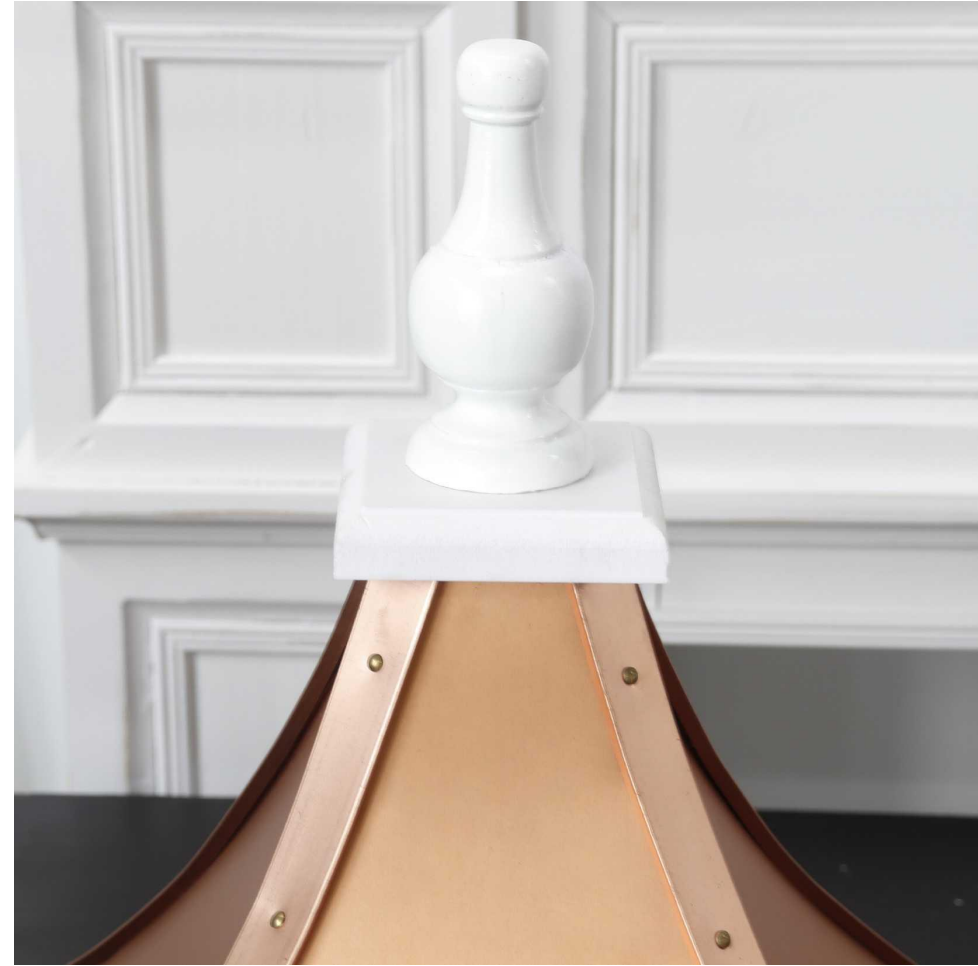
Step 6 Screw the top fitting into the bird's house