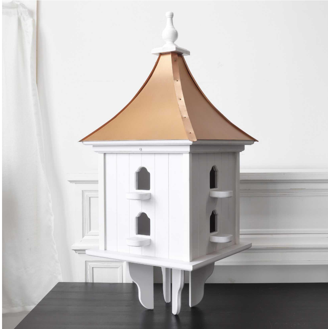
Final bird house